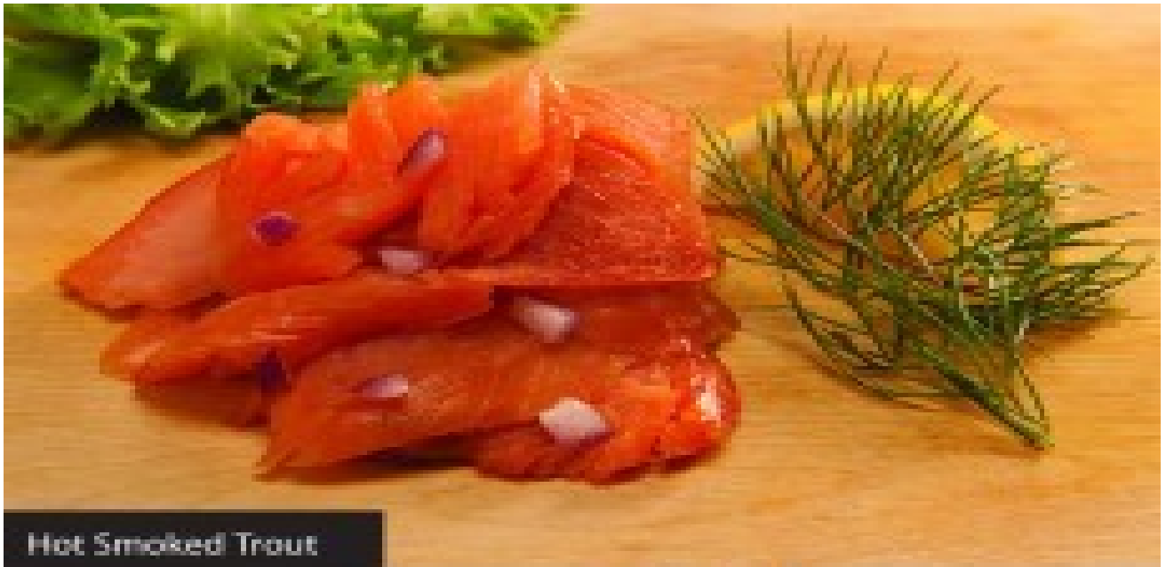
Hot Smoked Trout